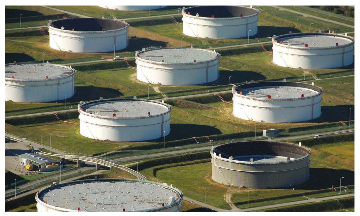
Whether your concern is gasoline, jet fuel, diesel, or bio-fuels, TraceTek can provide a customizable leak detection system tailored to meet your needs. With the TraceTek leak detection system, you can detect and pinpoint the source of a leak to help you take decisive action long before the spill can ruin your reputation.